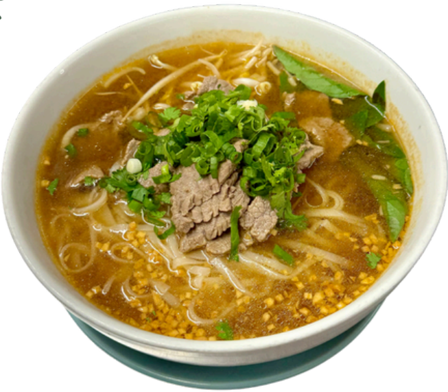
Pho Noodle Soup w/Beef