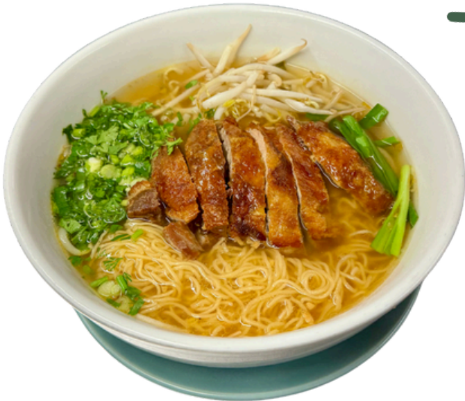
Duck Noodle Soup