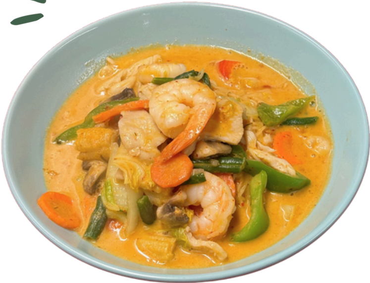
Thai Pasta 🌶️