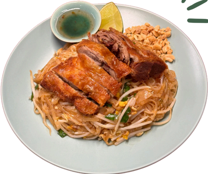
Duck Pad Thai