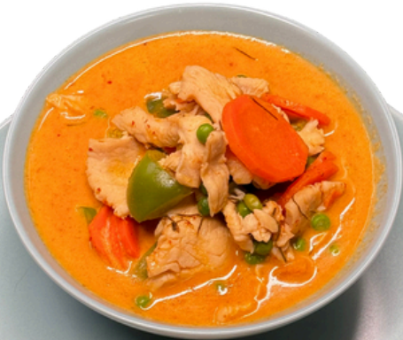
Panang Curry w/Chicken 🌶️