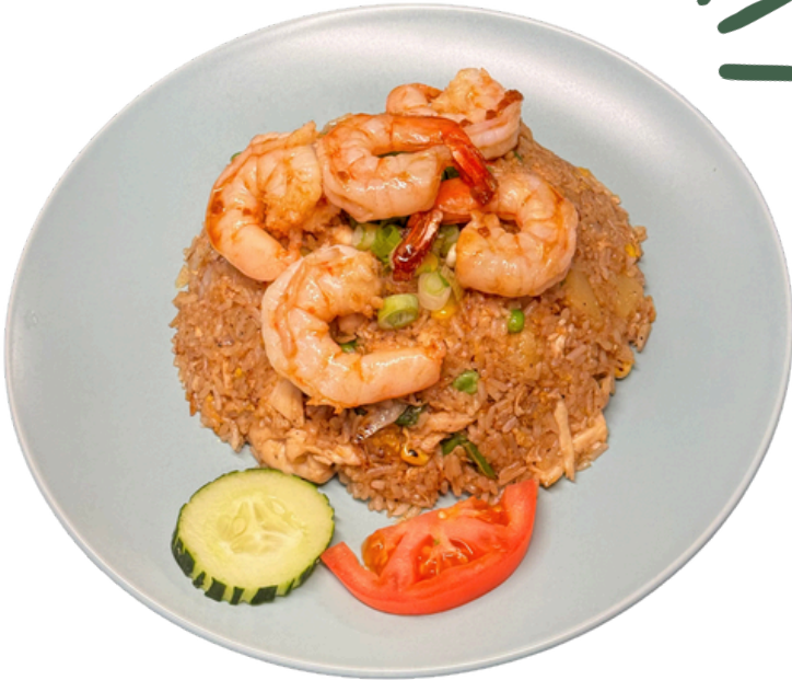
Pineapple Fried Rice w/Shrimp