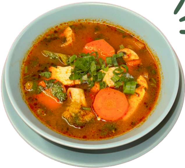
Tum Yum Soup 🌶️