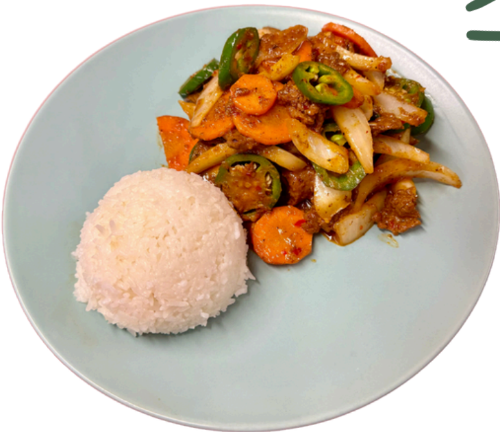
Thai Spicy Beef 🌶️🌶️🌶️🌶️

Parties of 5 and above includes a 20% gratuity charge.