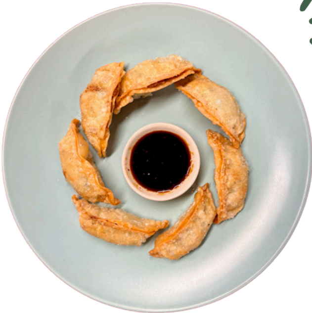
Fried Vegetable Dumplings

Parties of 5 and above includes a 20% gratuity charge.