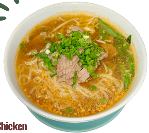
Kao Soy Noodle Soup w/Chicken