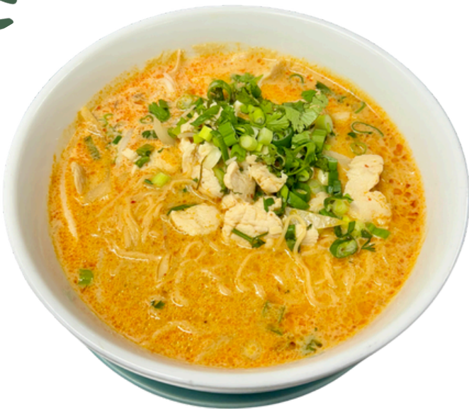
Kao Soy Noodle Soup w/Chicken