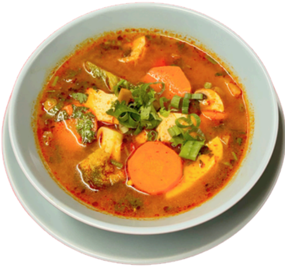
Tum Yum Soup