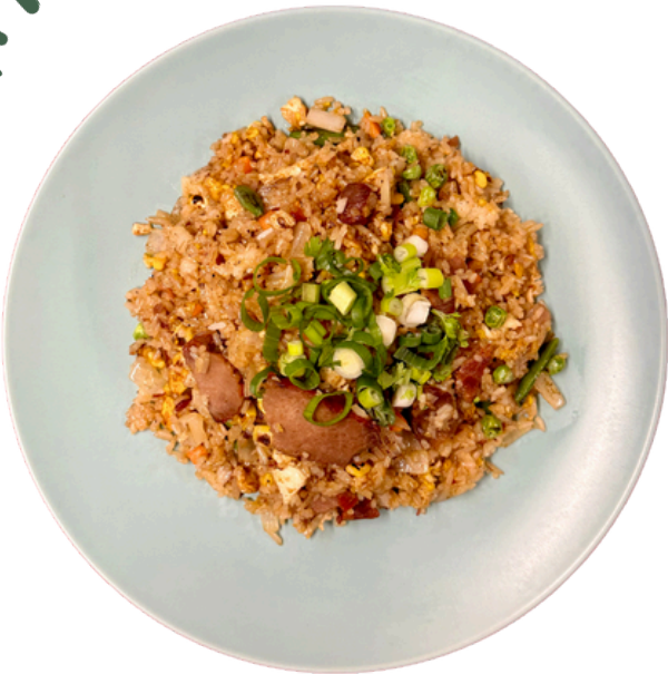
BBQ Pork Fried Rice