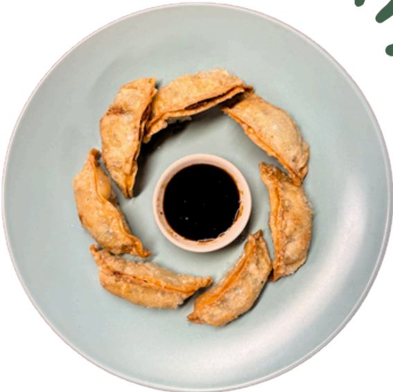
Fried Vegetable Dumplings

Parties of 5 and above includes a 20% gratuity charge.