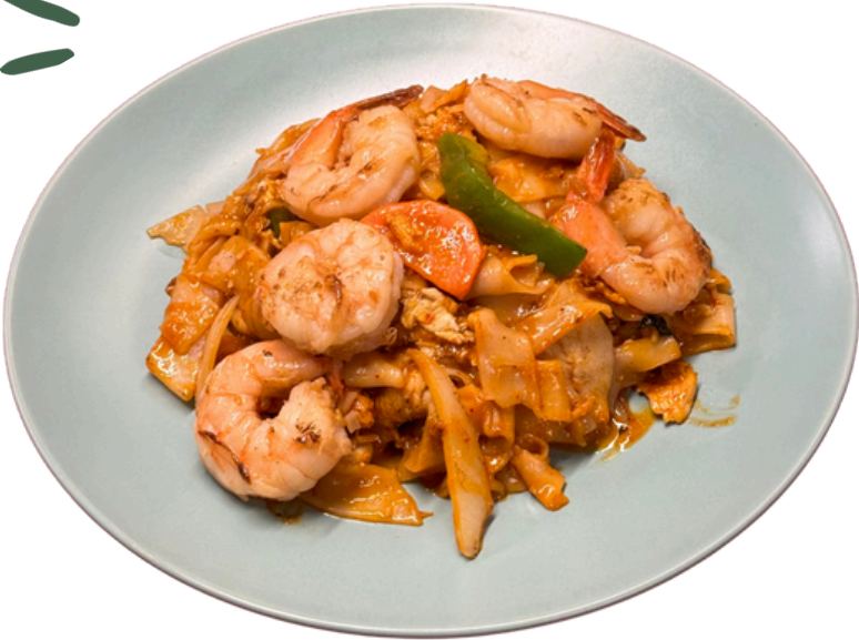
Drunken Noodle w/Shrimp 🌶️