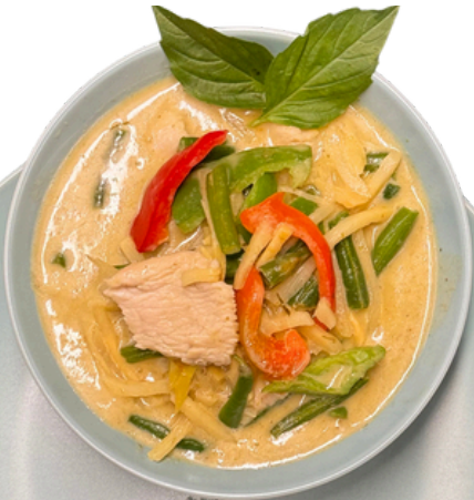
Green Curry w/Chicken 🌶️