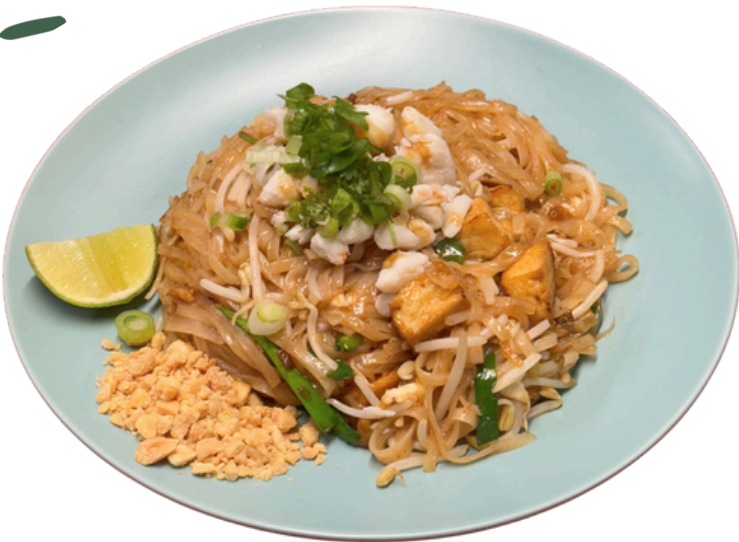
Crab Pad Thai