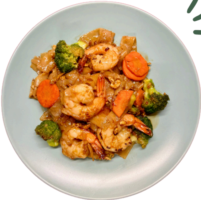
Pad Se Ew w/Shrimp